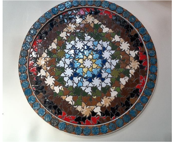
Living Well installation