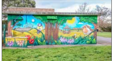
Find out What year did the Bowls Club celebrate its centenary?